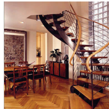
Caspi Residence - Custom Stair & Rail