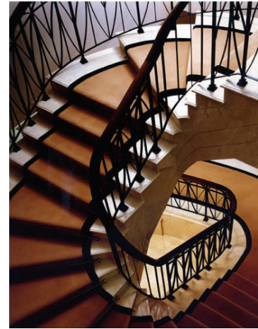
Mackay Sheilds - Custom Stair & Rail